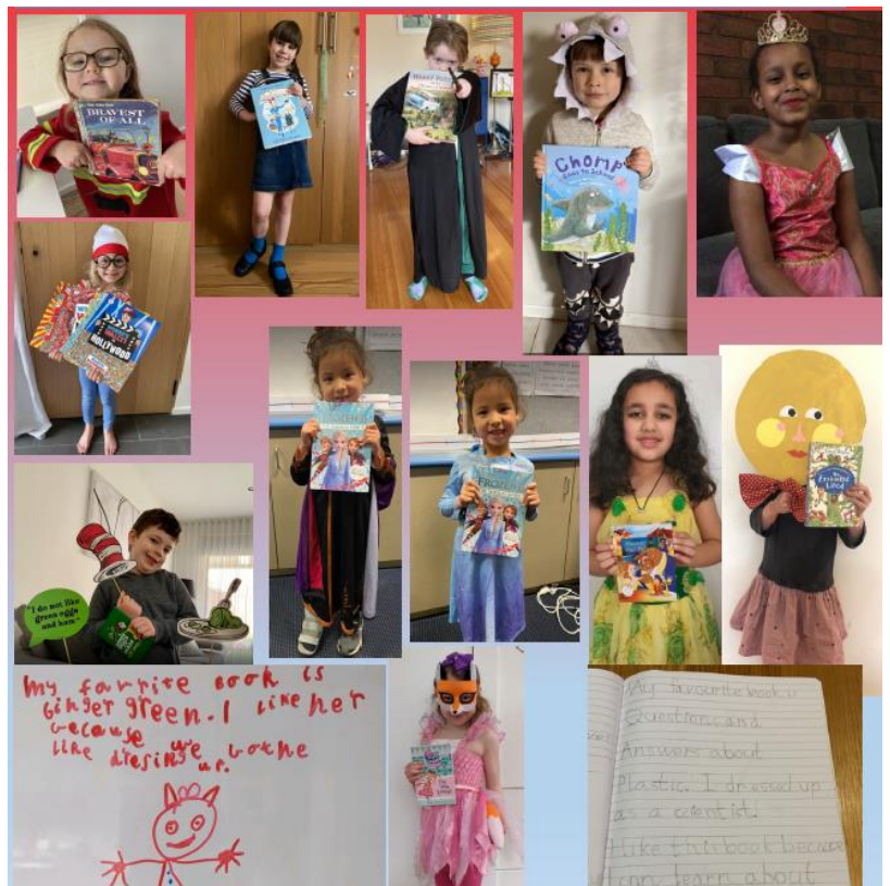
The students in FFW dressed up as their favourite book characters.

All of the staff at Kingsville PS would like to say a big well done and congratulations to all of students (and parents) who got involved.